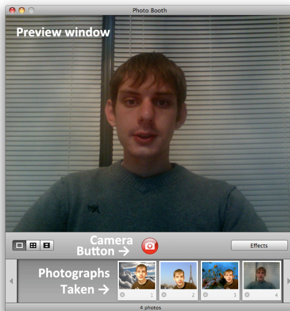
Figure 3: Photo Booth window